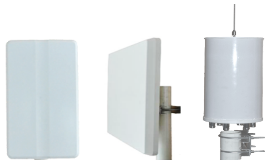
Outdoor Antennas (from left to right):